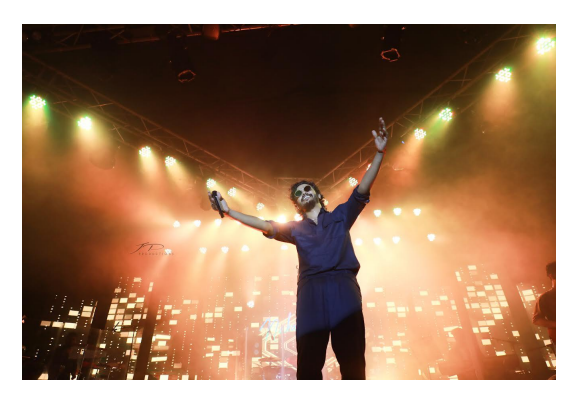
behind many super hits from Bollywood.

An extraordinary dance showcase by the winners of 'D 4 Dance' Season 3, Team Aliyans made day 2 more powerful. Day 2 also had a special performance by the dance crew from Thrissur - 'Myself and My Moves' popularly known as 'MMM'. The 12th edition of Yagna Dhruva had its closing ceremony with an energetic proshow by the exemplary Bollywood singer Nakash Aziz who is the voice