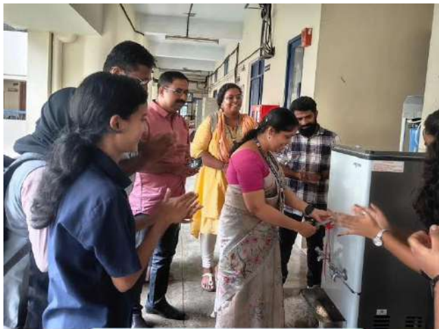
Stay Cool, Hydrated, and Refreshed! We're excited to announce the inauguration of our brand-new cooler, sponsored by the PTA and proudly supported by College Union '24!